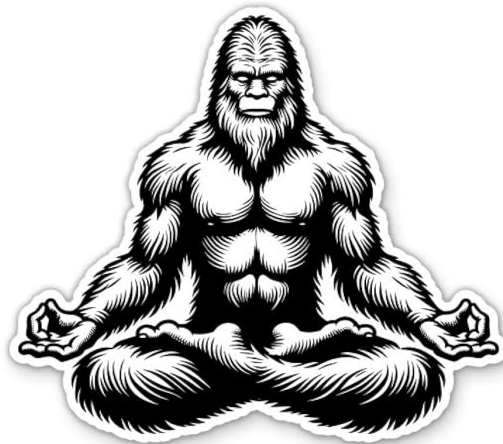
AK Wall Art